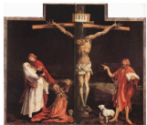
Lenten Life Calendar